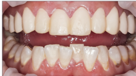
Temps Retracted View-Open