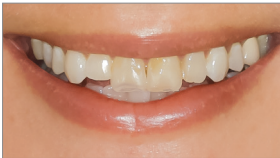
REPOSE (Pre-Op Lip Line)